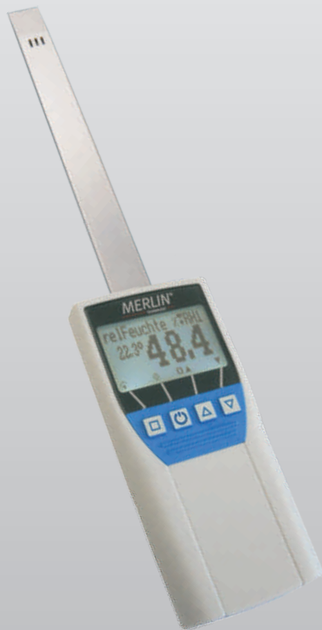
HM8 - RLF/TS